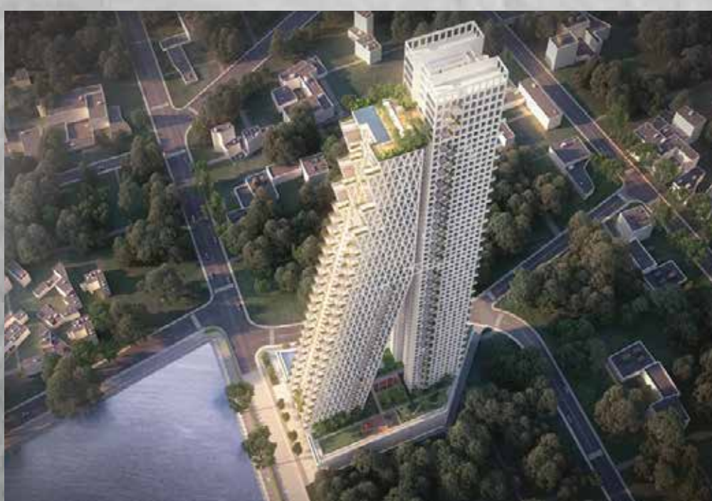
Altair | Colombo, Sri Lanka