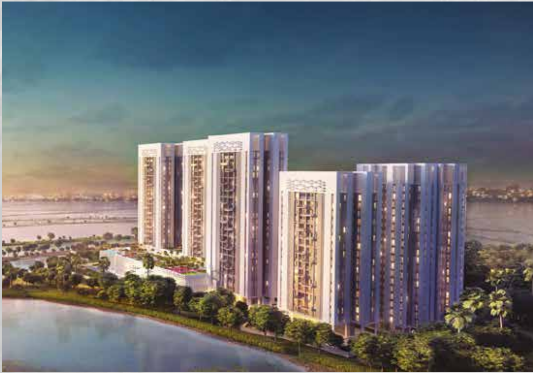
Fifth Avenue | Sector-V, Salt Lake