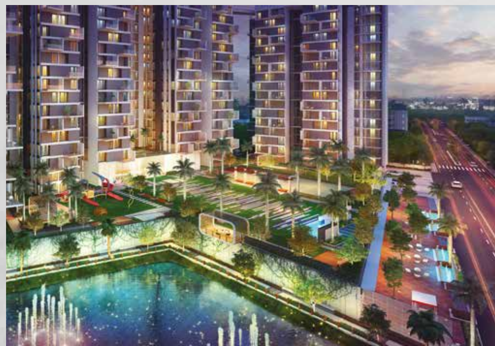
The One | Tollygunge, Kolkata