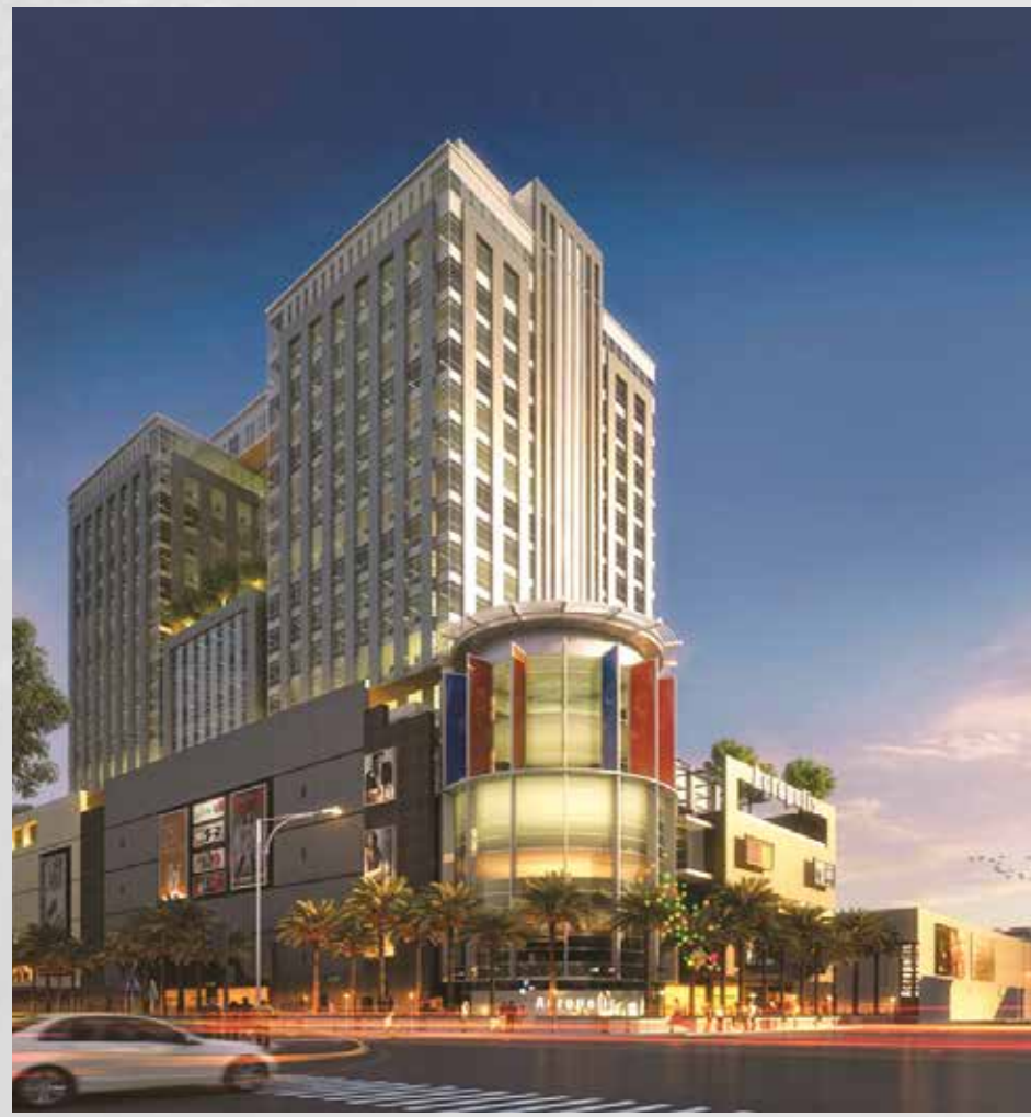
Acropolis Mall | Kolkata