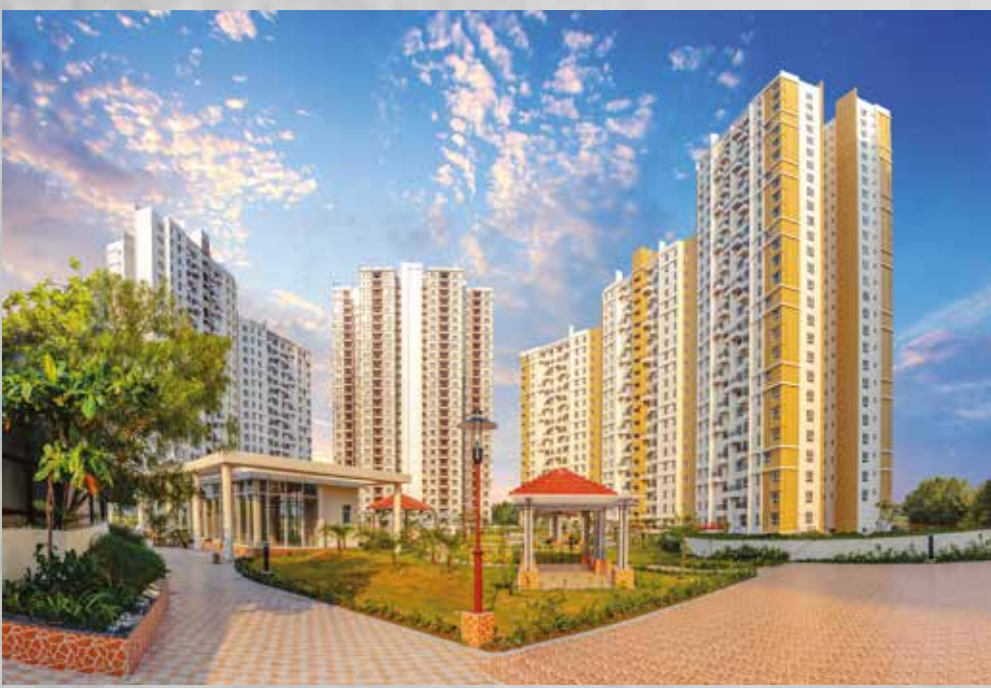
Elita Garden Vista | New Town, Kolkata