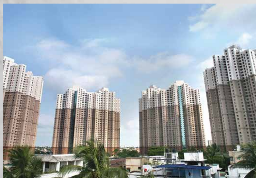
South City Residence | Kolkata